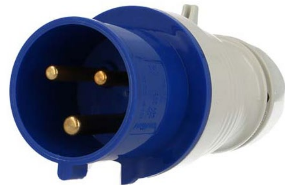
Monophase socket P17 16A 220V