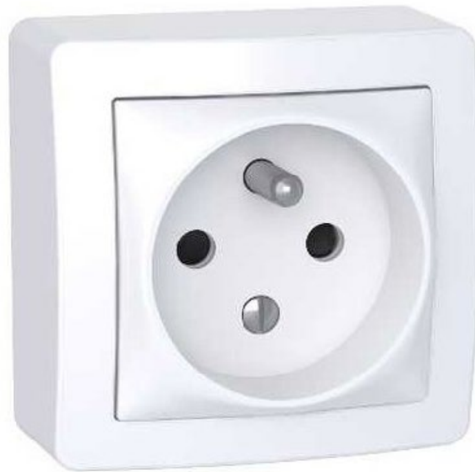
Monophase socket (16A 220V) (3kW maximum)